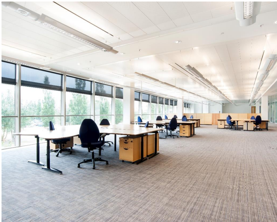
Example office suite, not actual space

Make the right impression with a relatively small office found within an exciting business park, entertain your clients in one of the communal break-out areas, meeting rooms (additional charge) and on-site restaurants.