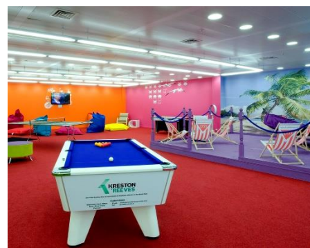
The Playroom: Relax and wind down at the end of the day with a game of pool, table tennis or practice your putting.